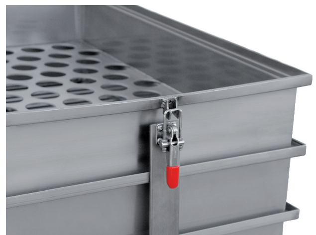
A quick clamping device allows quick mounting of the screen trays